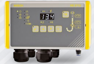
HE 5712* Compact design Ex