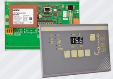
HE 5712 Modular design