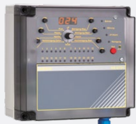
HE 5721 FP