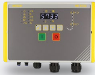
HE 5733 Ex