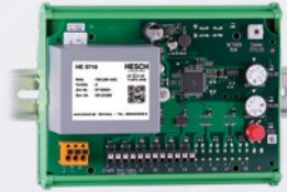
HE 5710 on standard rail