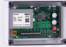
HE 5710 in Makrolon housing Ex